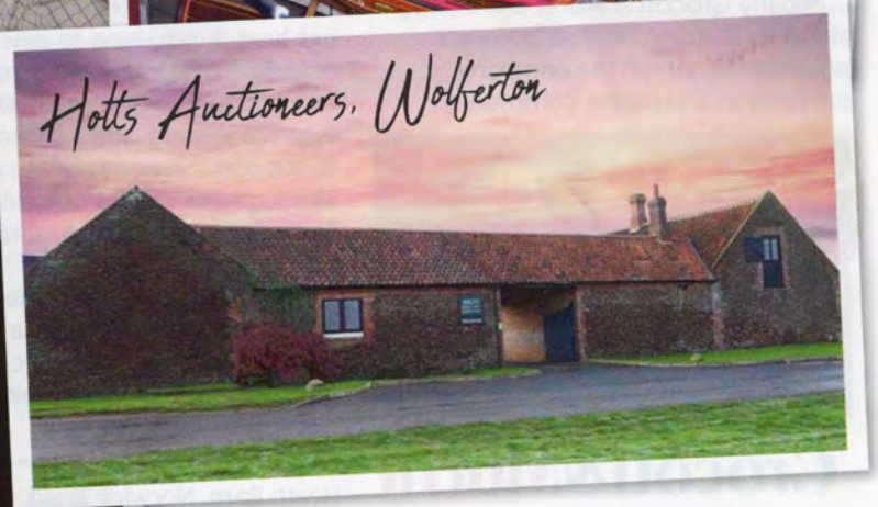
Hott's Auctioneers, Wolferton