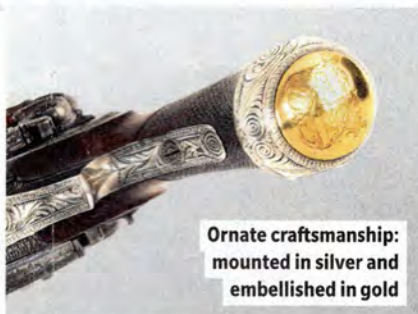
Ornate craftsmanship: mounted in silver and embellished in gold

Second, they were phenomenally expensive in their day and were only ever purchased by royalty, titled persons and extremely well-heeled officers. When these were made in 1815, they would have cost in the region of £50. While only around £5,000 in