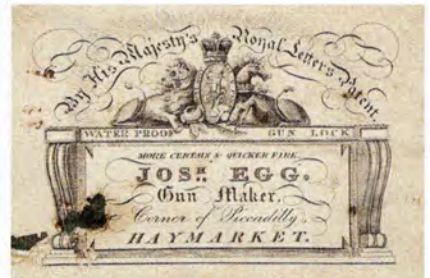
The gun company's elaborate label

So what made these guns special? First, these sets are unique in the world of antique firearms as no other maker produced a