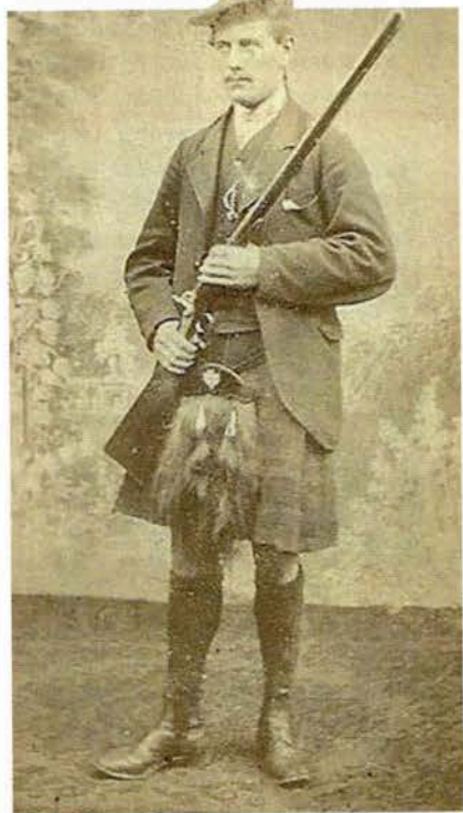
Charles Ferrier Gordon was born in 1854

When these guns were sold in the 1908 auction of Gordon's property, they were separated as Lots 333 and 334, fetching 65/- and £4 respectively; quite a lot in comparison to many of the other guns sold. This was, perhaps, because blunderbusses were reasonably well collected as decorators even